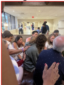
Spontaneous prayer with our family!