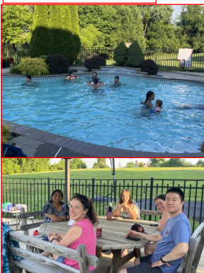
ESL Pool Party